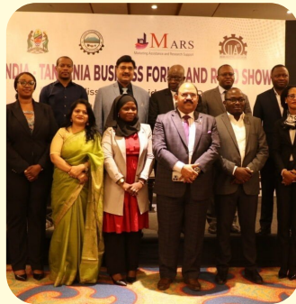
India-Tanzania Business Forum and Road Show at UP, Gujarat and Telangana