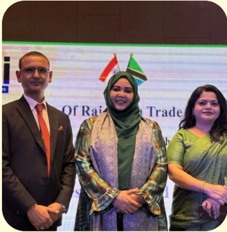
India-Tanzania Business Forum & Roadshow 2024: 13th – 23rd October, 2024 at Haridwar, Jaipur, and Mumbai