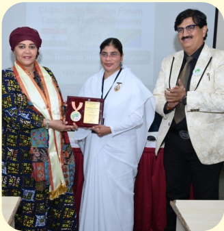
India-Tanzania Investment Forum at Ahmedabad, Pune and Bengaluru