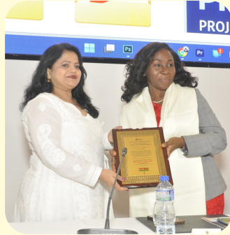
Benin and Togo Business Delegation : 23rd -28th June, 2024