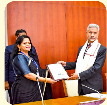
Nigeria – India Business Delegation