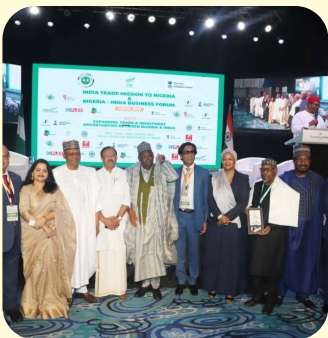
Tanzania – India Business Delegation