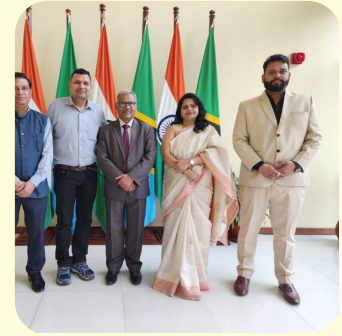
Business Delegation: Exploring Investment Opportunities in Tanzania (21st-25th April, 2024)